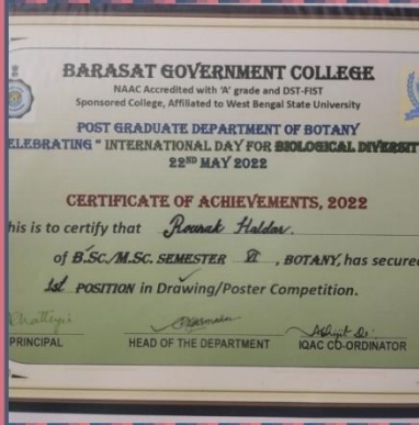
PRINCIPAL HEAD OF THE DEPARTMENT IQAC CO-ORDINATOR