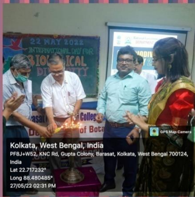
Kolkata, West Bengal, India PF8J+W52, KNC Rd, Gupta Colony, Barasat, Kolkata, West Bengal 700124, India Lat 22.717232° Long 88.480485° 27/05/22 02:31 PM