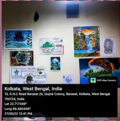
Kolkata, West Bengal, India 10, K.N.C Road Barasat (N), Gupta Colony, Barasat, Kolkata, West Bengal 700124, India Lat 22.717346° Long 88.480449° 27/05/22 12:41 PM