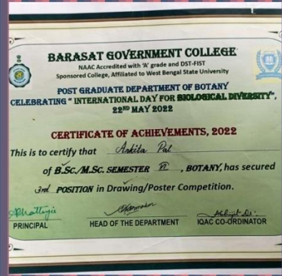
PRINCIPAL HEAD OF THE DEPARTMENT IQAC CO-ORDINATOR