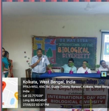
Kolkata, West Bengal, India PF8J+W52, KNC Rd, Gupta Colony, Barasat, Kolkata, West Bengal 700124, India Lat 22.717028° Long 88.480454° 27/05/22 02:37 PM